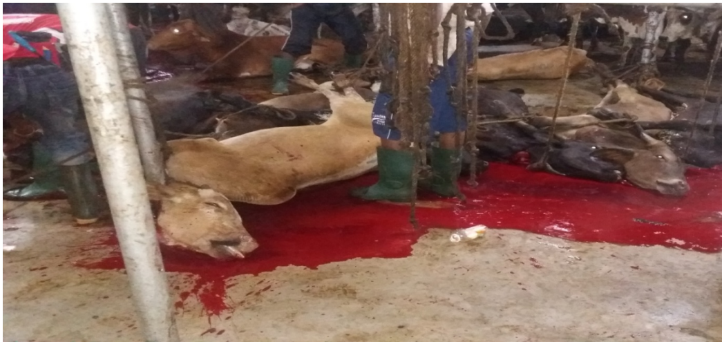
Photo 3.1: Showing Unhygienic Slaughtering, skinning, dressing and Evisceration done on dirty area photo taken at Lufaveso slaughter facility.

Slaughtering is carried-out in dirty areas: The audit team observed that skinning , dressing and evisceration were done on the bare floors which were littered with blood from animals slaughtered and other wastes posing a great risk to contamination of meat as depicted on Photos 3.1 up to 3.3. This is because 75 percent of the visited slaughter facilities lacked separation of clean and dirty areas as presented in Section 3.2.1.