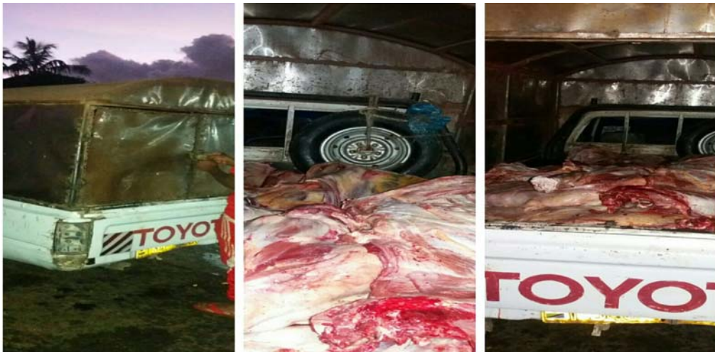
Photo 3.4: Shows unhygienic Meat Van with Rust board/container Carrying Meat together with Spare Tyre at Luvafeso (Kimara suka) Slaughter Facilities on 8.12.2015

(c) Inadequate Inspection of Meat Carriers: With exception of Interchick and Dodoma Abattoirs the audit team did not see any evidence of inspection on meat carriers that was conducted by inspectors. This is because large quantity of meat was transported during the night whereby meat inspectors were hardly available at night. The audit team observed that, while meat inspectors proceed with meat inspection, meat owners were transporting the inspected meat at the same time. Therefore it was difficult for a meat inspector to handle both the physical meat inspection and meat van inspection (transportation) at the same time to verify whether meat is being carried by vans that comply with the requirements of meat transport.