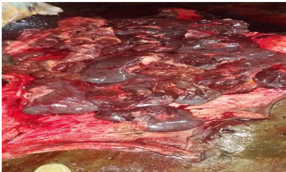
Photo 3.7: Showing Mixed Livers and Kidney from different slaughtered animals during the Inspection at Lufaveso slaughter facility in Kinondoni MC.