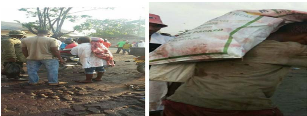
Photos 3.6: Shows unhygienic movement of Meat within the facilities Vingunguti Slaughter

Improper Movement or Transportation of Meat within the Slaughter Facilities: The Tanzania Food, Drugs and Domestic (Food hygiene), 2006 Regulation 12 (a) requires any person who, owns, operates or in charge of a food premises to ensure food transportation is conducted in a hygienic matter. The audit team found unhygienic movements of meat within Vingunguti slaughter facility which could easily lead to transmission of diseases from people to meat and vice versa see Photos 3.6.