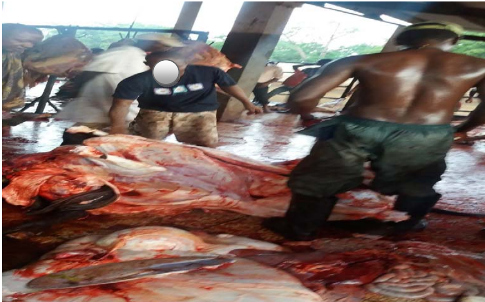
Photo 3.3: Showing People Performing Activities within the Slaughter Facility without having Protective Gears and dressing and evisceration is done on floor at Vingunguti Slaughter Facility on 11.12.2015

activities without wearing protective gears such as white coats, gloves, caps and boots to protect them and avoid contamination of meat (Photo 3.3). In other areas, staffs were provided with only one pair of protective gear which was not adequate for them to use every day. Other owners did not provide protective gears to staff and told them to buy their protective gears from their own pocket. In addition, there were staff with protective gears but were reluctant to use them due to low understanding (lack of awareness) of their importance and weak enforcement of law refers Photo 3.3.