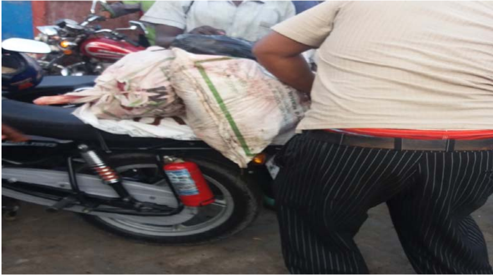
Shows meat traders with no protective gears parks meat at unauthorized motorcycle ready for safaris at Vingunguti Slaughter Facilities on 11.12.2015

Improper Movement or Transportation of Meat within the Slaughter Facilities: The Tanzania Food, Drugs and Domestic (Food hygiene), 2006 Regulation 12 (a) requires any person who, owns, operates or in charge of a food premises to ensure food transportation is conducted in a hygienic matter. The audit team found unhygienic movements of meat within Vingunguti slaughter facility which could easily lead to transmission of diseases from people to meat and vice versa see Photos 3.6.